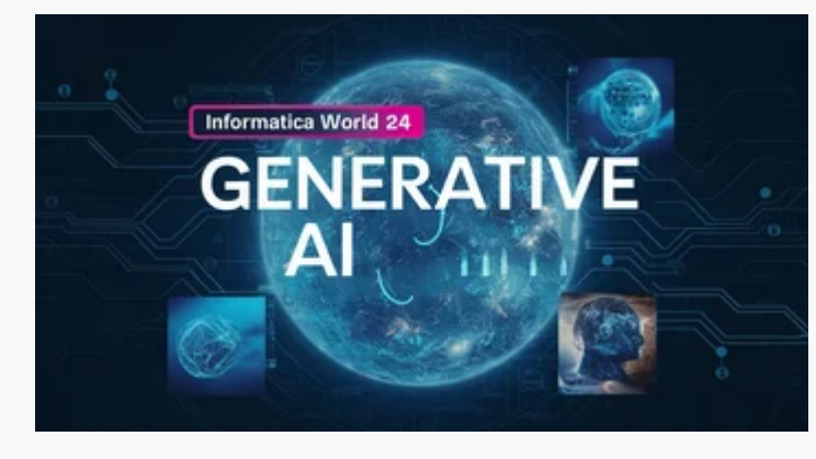
Data Quality at Informatica World 2024: Elevating Standards with Al

Generative Al at Informatica World 2024: Transforming Data Management